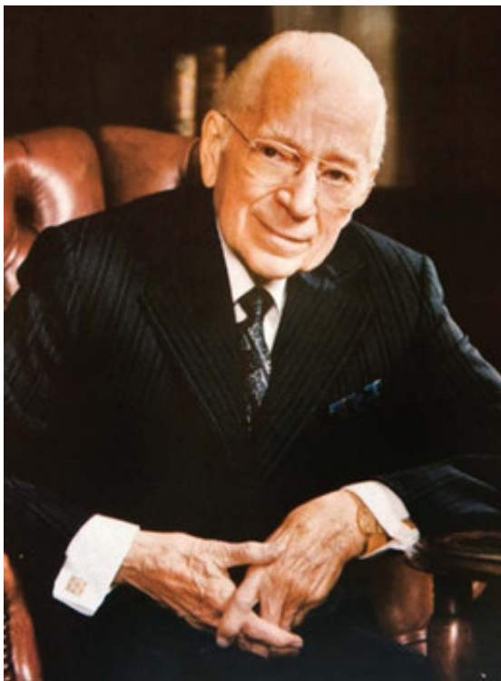
Herbert W Armstrong